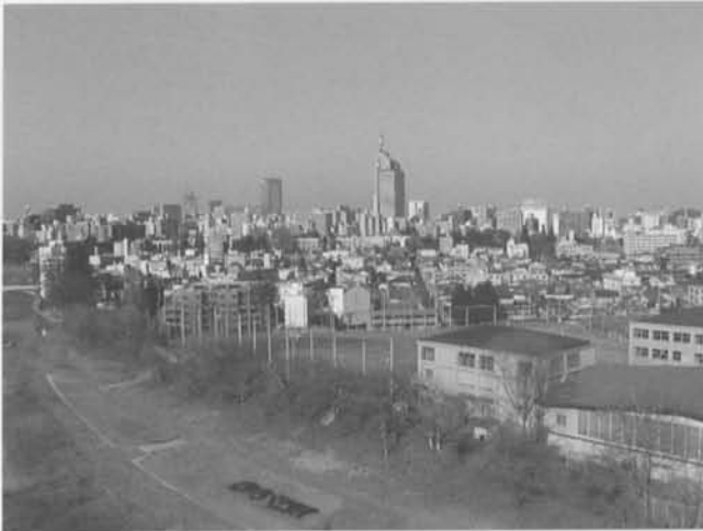
City central of Sendai

Sendai is located about 350 km north of Tokyo. And it is called capital of north east of Japan.