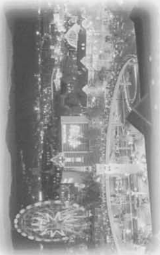
KURASHIKI TIVOLI PARK