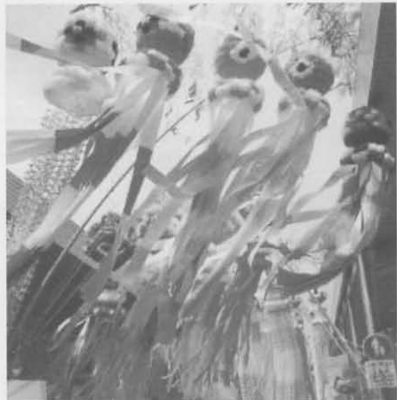
The TANABATA Star Festival

The TANABATA Star Festival is the one of the biggest festivals in Japan. And it is on August 5 to 8, during its period Sendai city is decollated with the colorful paper craft.